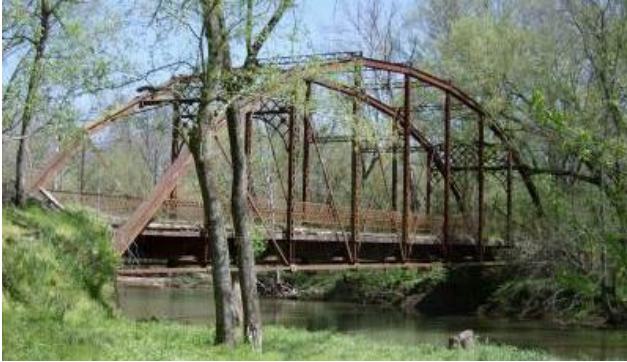
South Harpeth River Bridge, West Nashville, erected 1889, destroyed by floods in May.