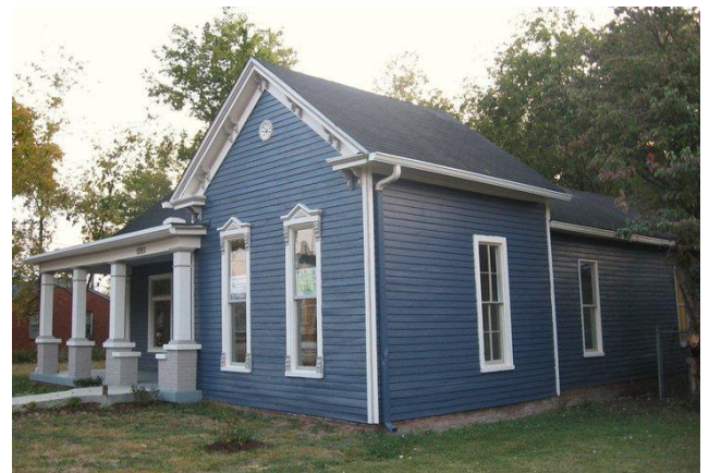
Before and after images of 704 Meridian Street.