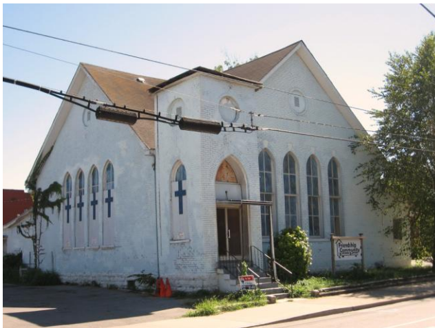
Friendship Community Outreach Center (North Nashville)