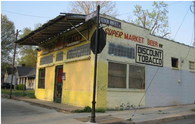
Winfrey's Barbershop, East Nashville, built 1924, demolished by developers in June.