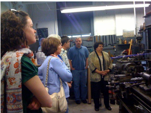
WSM Tower, April