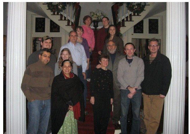
Belmont Mansion in the Snow, December