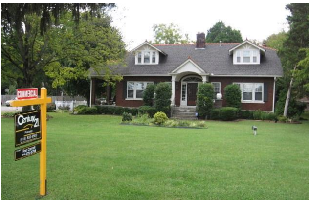
Gallatin Pike Historic District (Inglewood)