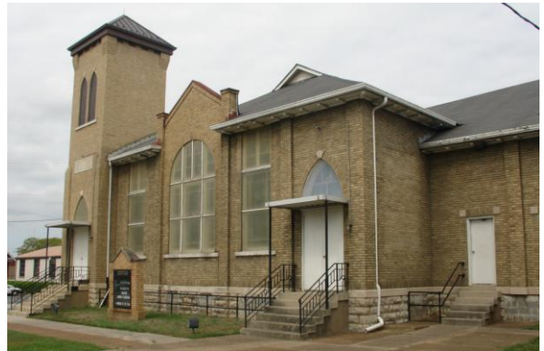
Charlotte Avenue Church of Christ, Richland Park, built in 1921, demolished by congregation in June.