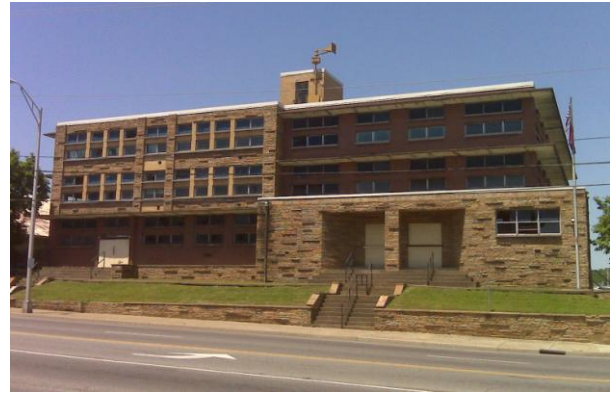
Tennessee Department of Highways & Public Works Building (Midtown)

Launched in 2009, the “Nashville Nine” program is intended to promote public awareness of endangered historic sites and encourage preservation advocacy at the grassroots level. The annual list features nine historic properties nominated by the public that are threatened by demolition, neglect, or development. The 2010 Nashville Nine includes a diverse range of properties dating from the antebellum era to the 1960s. These historic places help define Nashville’s unique sense of place and include: