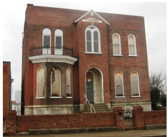
Iser-Bloomstein House / Workmen’s Circle Hall (SoBro)