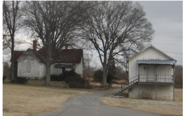
U.S. Army Corp of Engineers Buildings at Lock Two Park (Donelson) – 2010 Nashville Nine