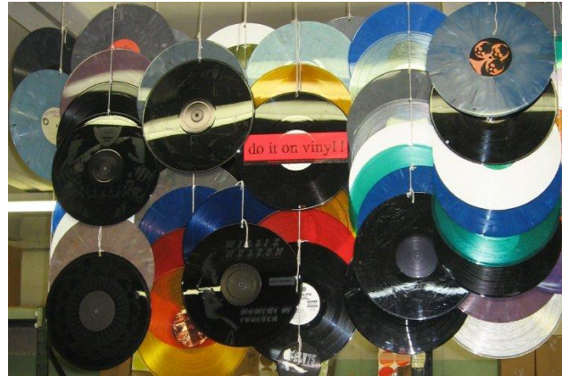
United Record Pressing, June