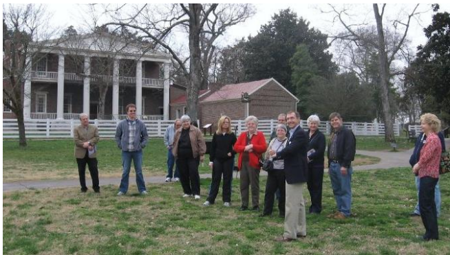
The Hermitage, March