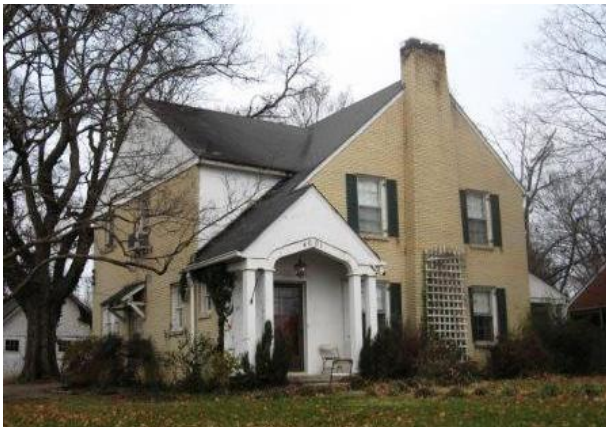
Albert L. Hadley House, Inglewood, built 1929, demolished by U.S. Bank in July.