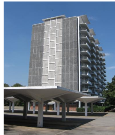
Imperial House Apartments (Belle Meade) 2010 Nashville Nine