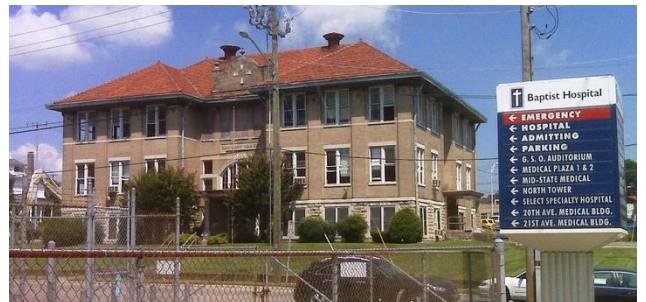
Samuel M. Murphy Public School, Midtown, built 1908, demolished by Baptist Hospital in June.