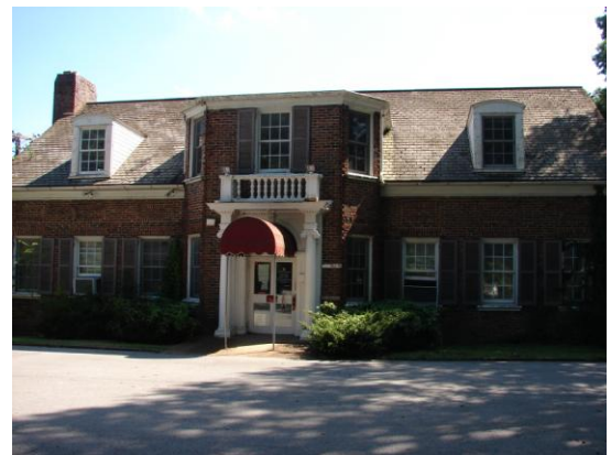
Dede Wallace Center (Woodland-in-Waverly)