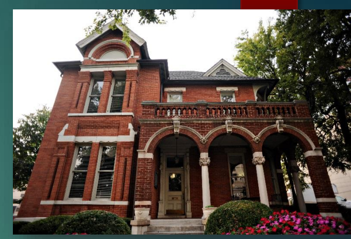
Albert Samuel Warren House - 1888

Learn more about the properties on this and previous years' Nashville Nine by visiting our website: www.historicnashvilleinc.org/nashvillenine