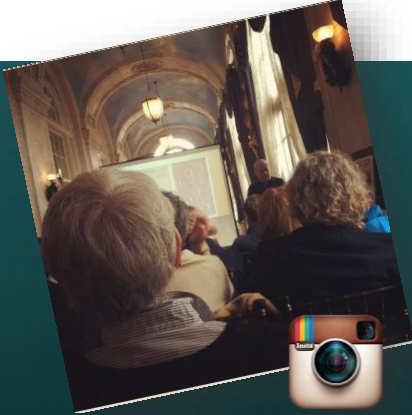
Historic Nashville 2014 Annual Report | Page 9

While you are snapping photos on your next Behind-the-Scenes tour upload them to Instagram on your mobile device! You can share the tour experience with your friends and fellow HNI members. Be sure to upload the @historicnashvilleinc or hashtag them #historicnashvilleinc or #keepnashvilleunique. We look forward to seeing your adventures with Historic Nashville!