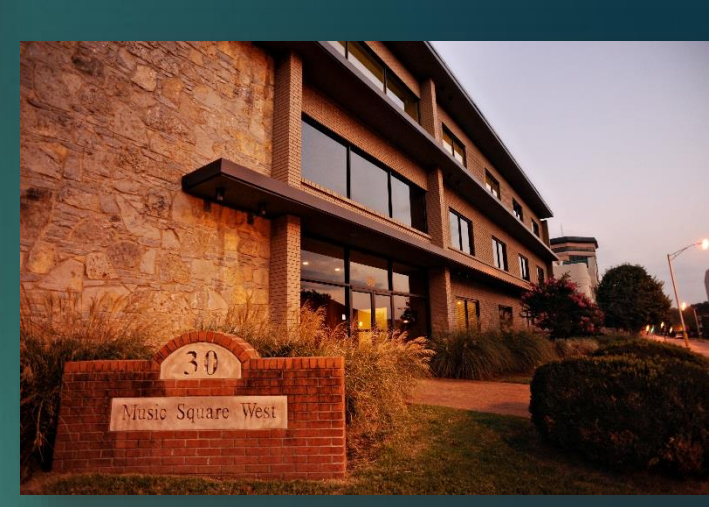
RCA Studio A- 1964