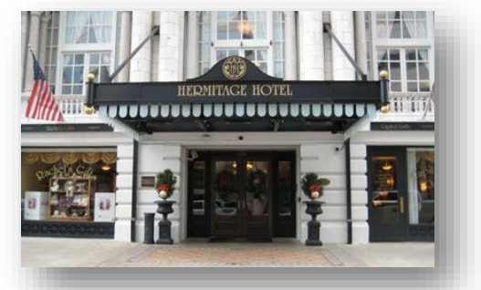
The Hermitage Hotel, an HNI easement property