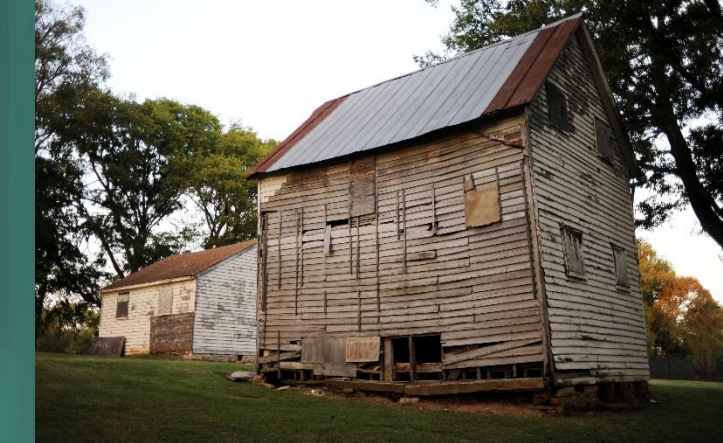
SUNNYSIDE OUTBUILDINGS – early 19<sup>th</sup> century