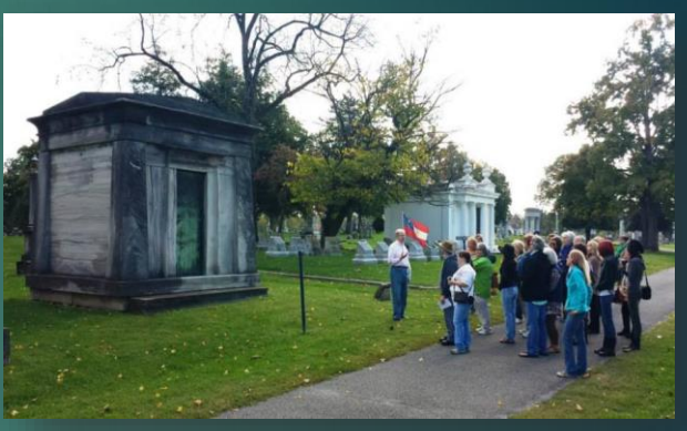
Above: HNI members on the Mt. Olivet Cemetery tour.