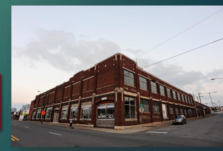
Coca Cola Bottling Plant – 1920s