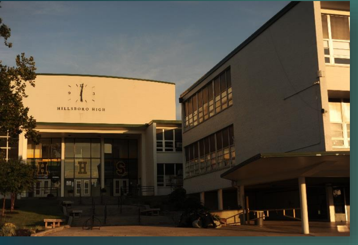
Hillsbord High School – 1954