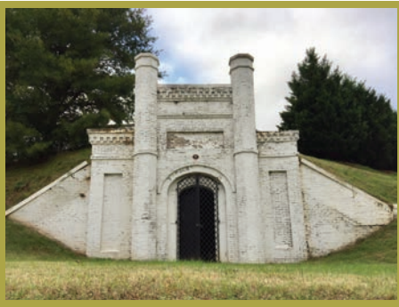
Mt. Olivet Cemetery Vault