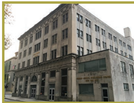
Morris Memorial Building