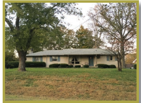
Post-War Mid Century and Minimal Traditional