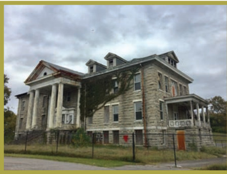
Home for Aged Masons Masonic School