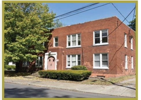
Burrus Hall - Fisk University