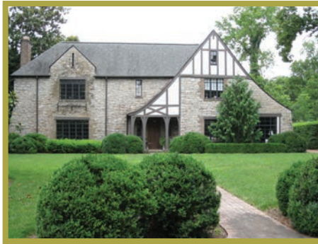
Historic Homes of Belle Meade