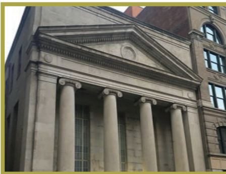
Federal Reserve Building