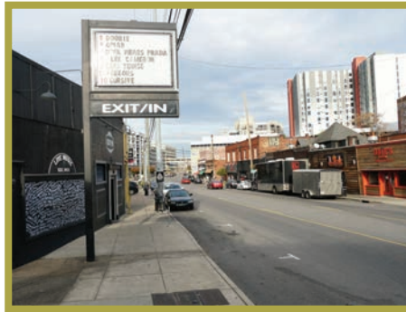
Rock Block - Elliston Place