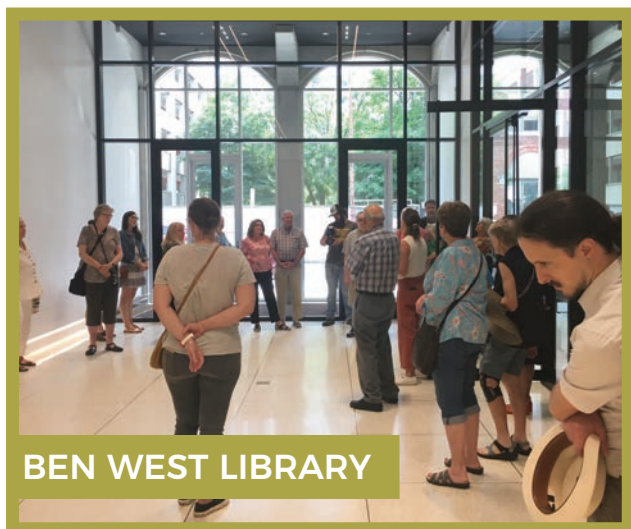
BEN WEST LIBRARY