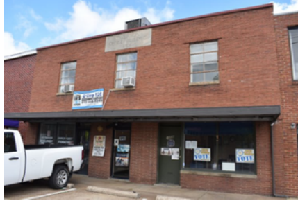
JW FRIERSON BUILDING