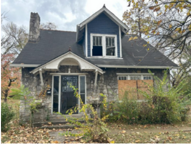
JOHNETTA HAYES HOUSE