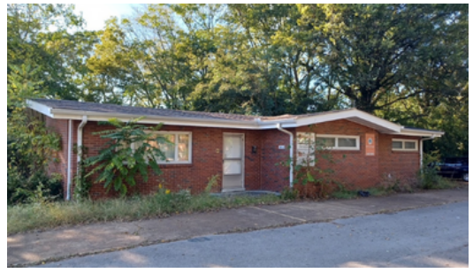
THE LOOBY HOUSE