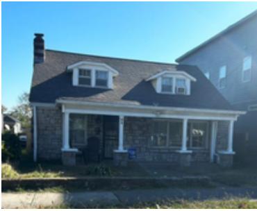
FRANKIE HENRY HOUSE