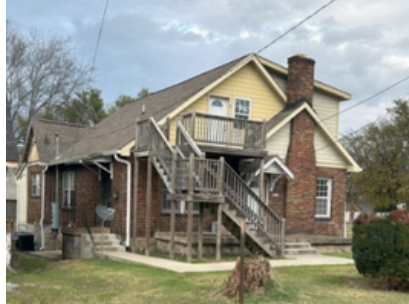
JUNO FRANKIE PIERCE HOUSE