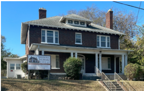
THE HUBBARD HOUSE